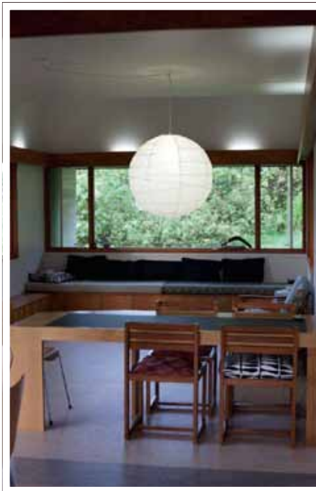
Pods can have a number of uses

The original house was built in five weeks and installed in under two weeks. Costs are kept down by constructing the pods in a factory, where contractors work on a production line, and the design is already certified, so clients do not have to pay for a certifier, structural engineer