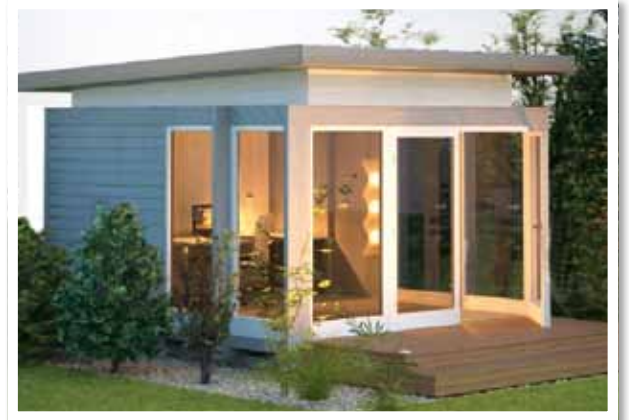
Pradella's SmartStudios arrive in a flat pack

Of course, like any extension or renovation, SmartStudios and Happy Haus projects are still subject to building approvals and soil tests, and time frames